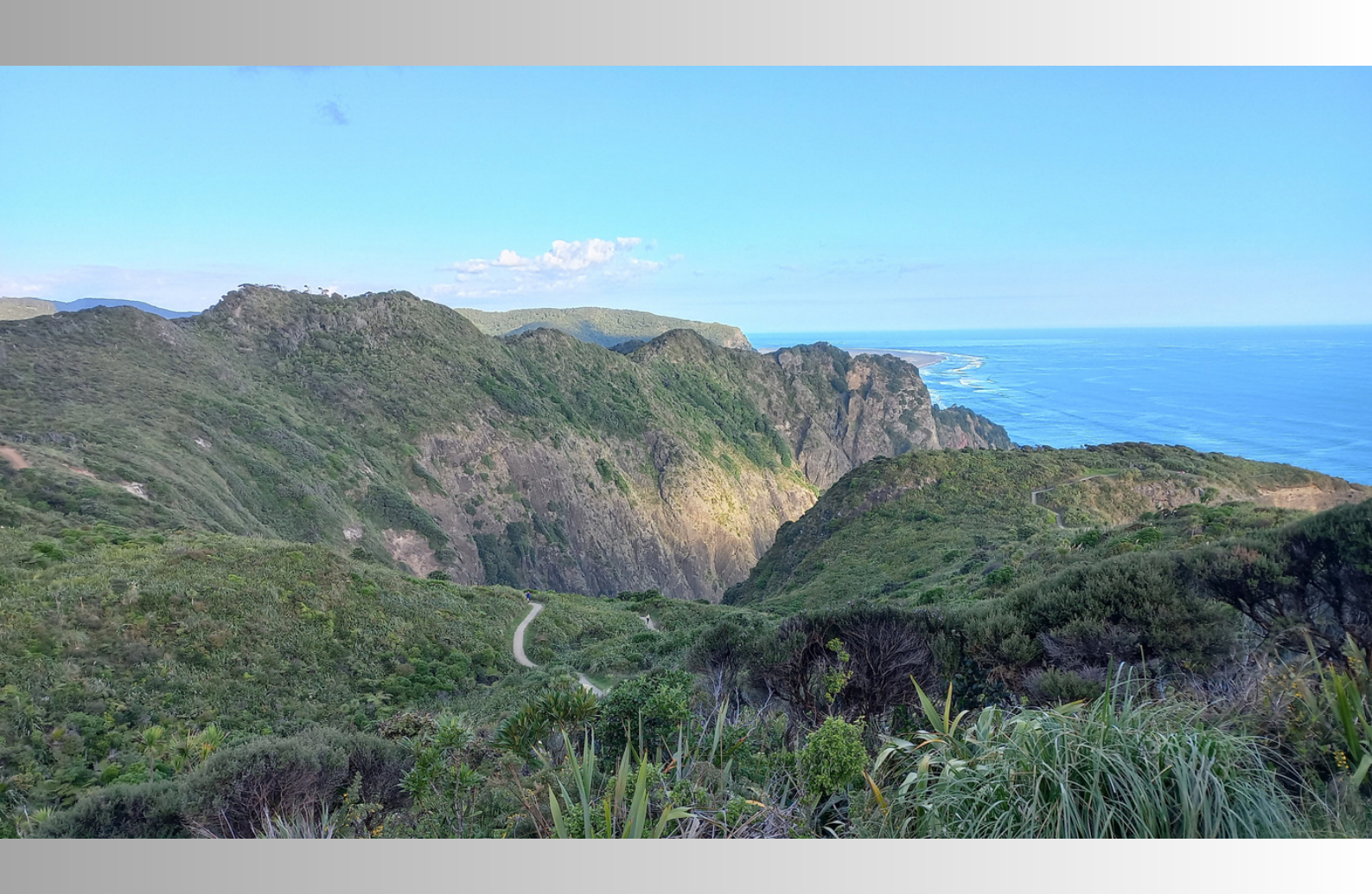
Day 5: Nature Walks

Take a nature walk in one of Seychelles' national parks like Morne Seychellois National Park or Vallee de Mai Nature Reserve