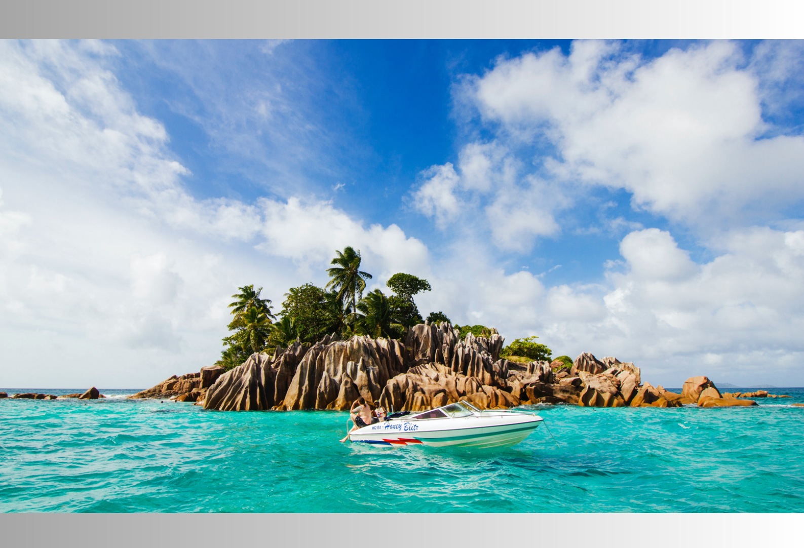
Day 1: Arrival and Relaxation

Arrive at Seychelles International Airport on the island of Mahé