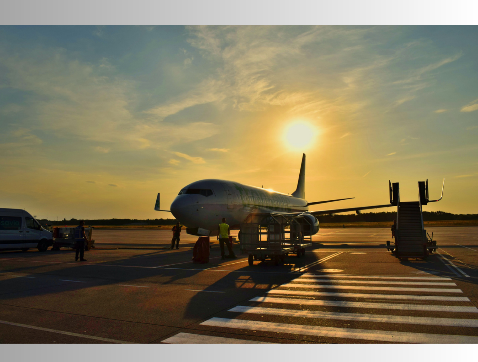
Day 7: Departure

Check out of your hotel and transfer to the airport for your departure flight