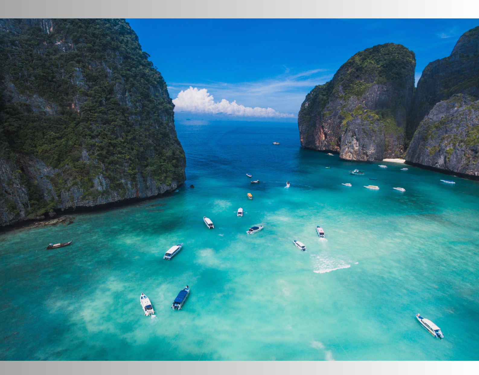
Day 3: Island Hopping

Take a day trip to some of Seychelles' smaller islands like Praslin, La Digue, or Silhouette Explore stunning beaches, coral reefs, and nature reserves