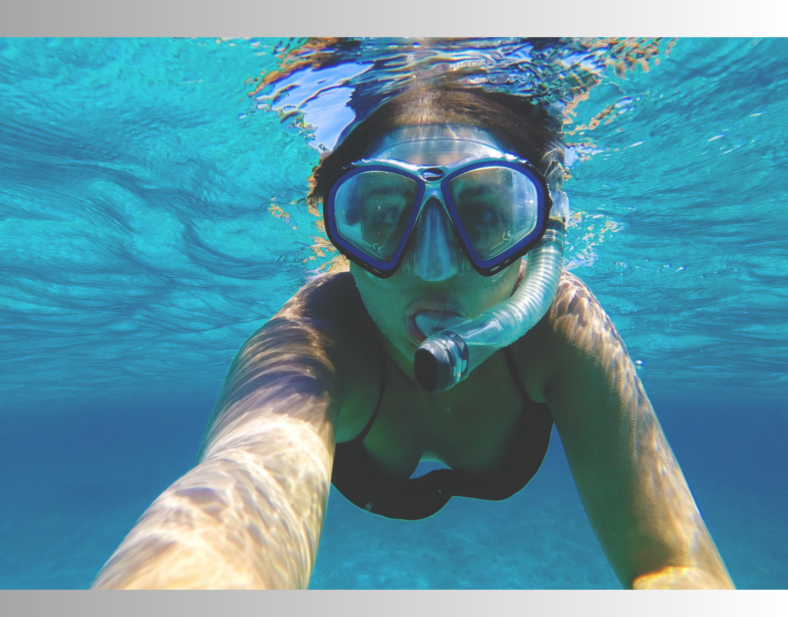
Day 4: Snorkeling and Diving

Take a snorkeling or diving excursion to see Seychelles' underwater world