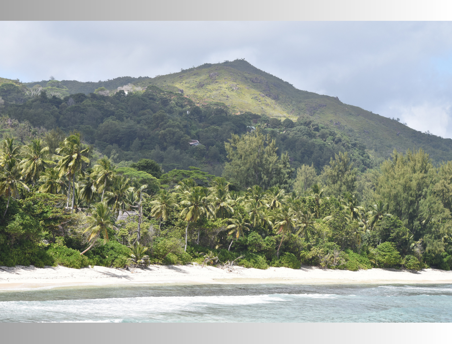
Day 2: Mahé Island Tour

Take a full-day tour of the island of Mahé, the largest island in Seychelles