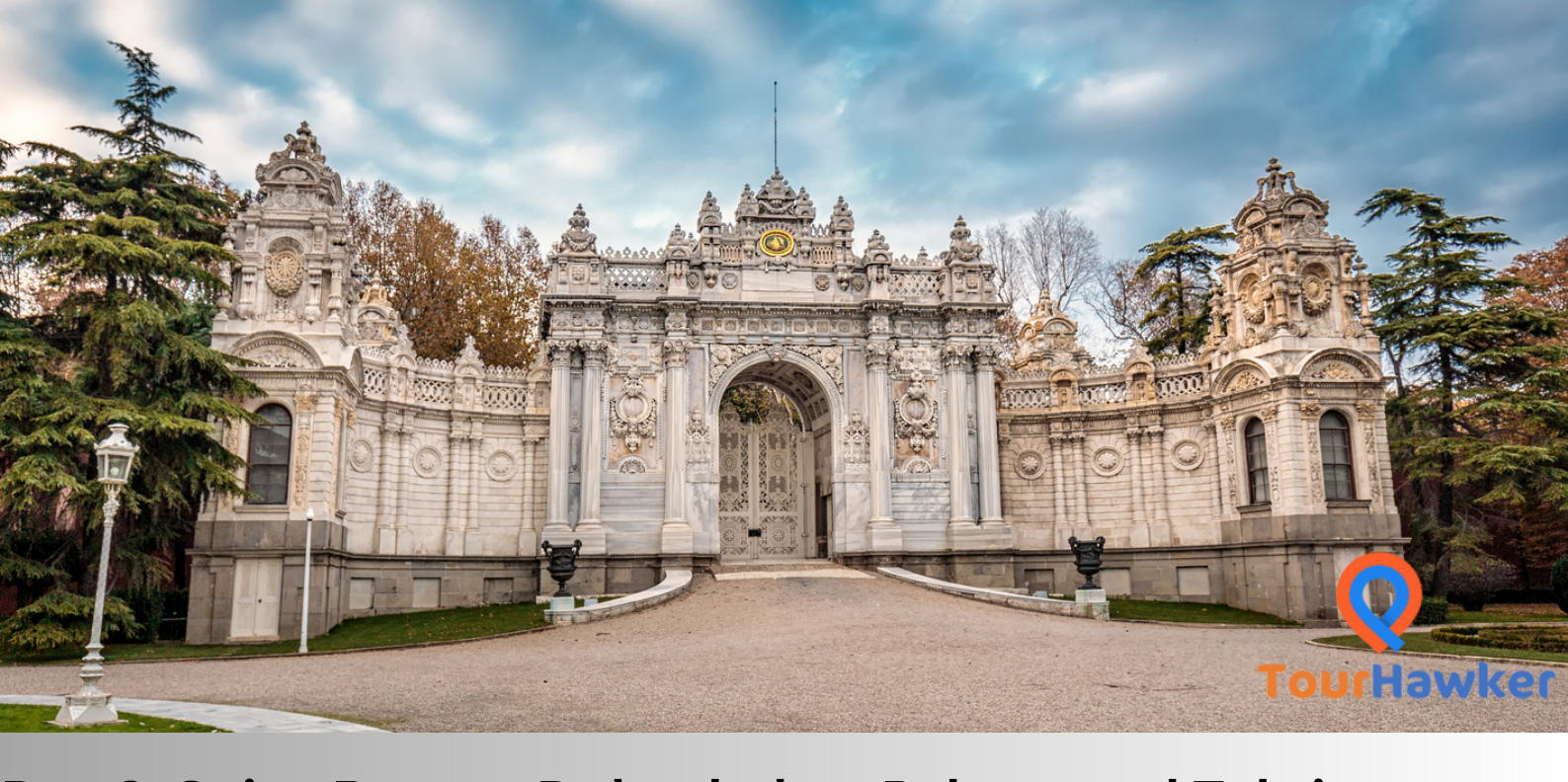
Day 3: Spice Bazaar, Dolmabahce Palace, and Taksim Square